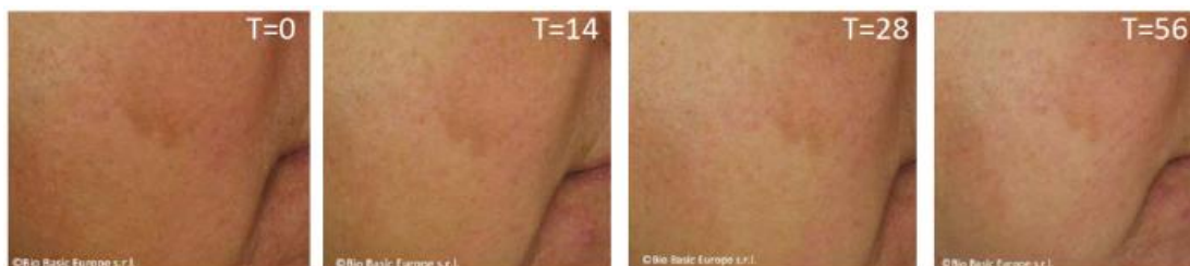
Volunteer visioface images after 14, 28 and 56 days of twice-daily treatment with 1% COBIOWHITE shows the improvement and lightening of the cheek spot.